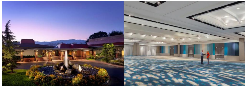
Hyatt Regency Monterey Hotel, Venue and Meeting Space

We offer several sponsorship levels to meet your needs, including in-kind contributions or sponsorship of certain events or activities (e.g., receptions, entertainment, field trips, scholarships).